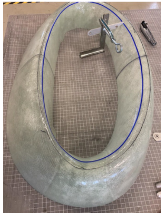
IPS LIP manufacturing test

The air intake will be equipped with a bypass for operation in clean flow and a compressor washing system. The full system will be tested and qualified through extensive testing, which will include Icing wind tunnel measurements and structural tests. TRICEPS will deliver the air intake, its engine protection system and all the relevant sub-systems at TRL 7.